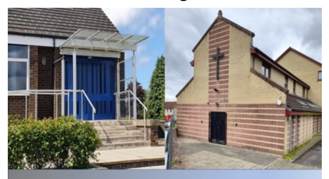
Welcome to Kirkintilloch St Columba's Hillhead Church